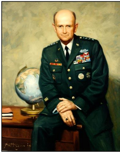
GEN Gordon Sullivan, former Chief of Staff of the Army

General Gordon Sullivan, the 32 nd Chief of Staff of the United States Army, had to cancel his trip to Dallas to attend a funeral with his family.