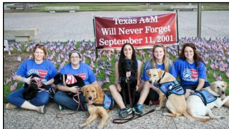
Patriot Paws of Aggieland

And, just this year, she has obtained approval from the Administration to establish Patriot Paws of Aggieland , an A&M student organization that adds to her pool of well-trained dogs.