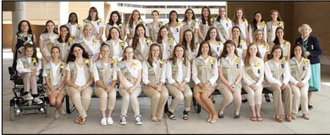
2017 Girl Scout Gold recipients of GS Northeast Texas Council

The Dallas Chapter will once again present Certificates to as many as 250 Gold Girl Scouts during the annual Awards Day Breakfast for GS Northeast Texas Council, in April . The GSNETX Council supervises the largest collection of GS Troops in the nation.