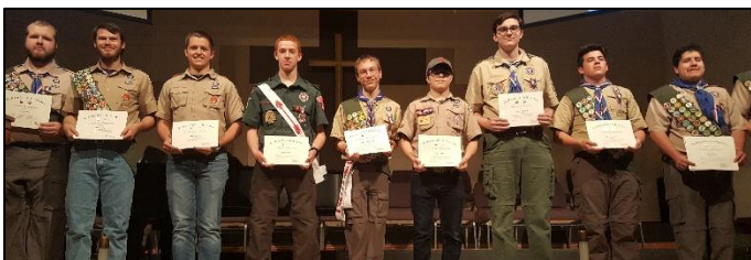
Some of the 35 BSA Eagle Scout recipients of the Lone Star Council, Jan 2018