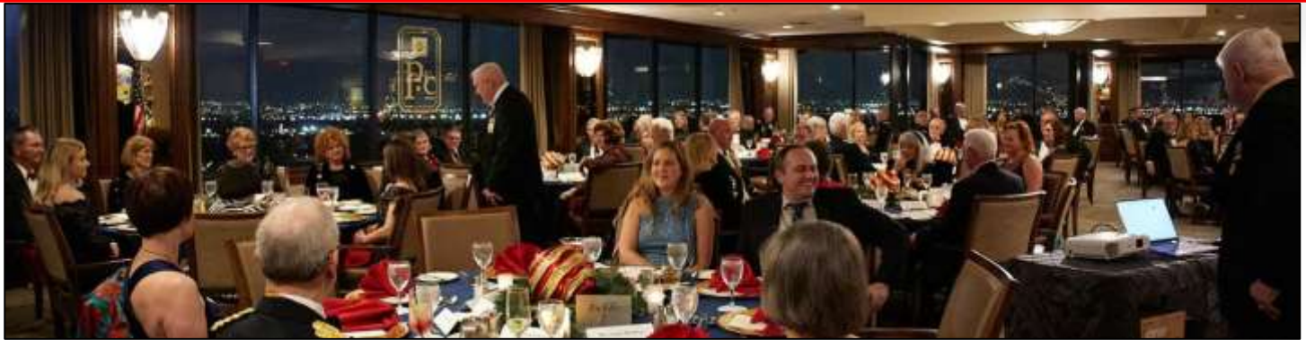
The skyline of Dallas provided a glow of lights that emphasized the beauty of the evening. The annual Christmas Banquet attracted a full house that included the National Commander-in-Chief, Companions from all of the North Texas chapters, a dozen officers from the Dallas Police Department, and more than a hundred others, who brought family and friends to share the joy of fellowship, camaraderie, and commitment to service that is the bedrock of our Order.