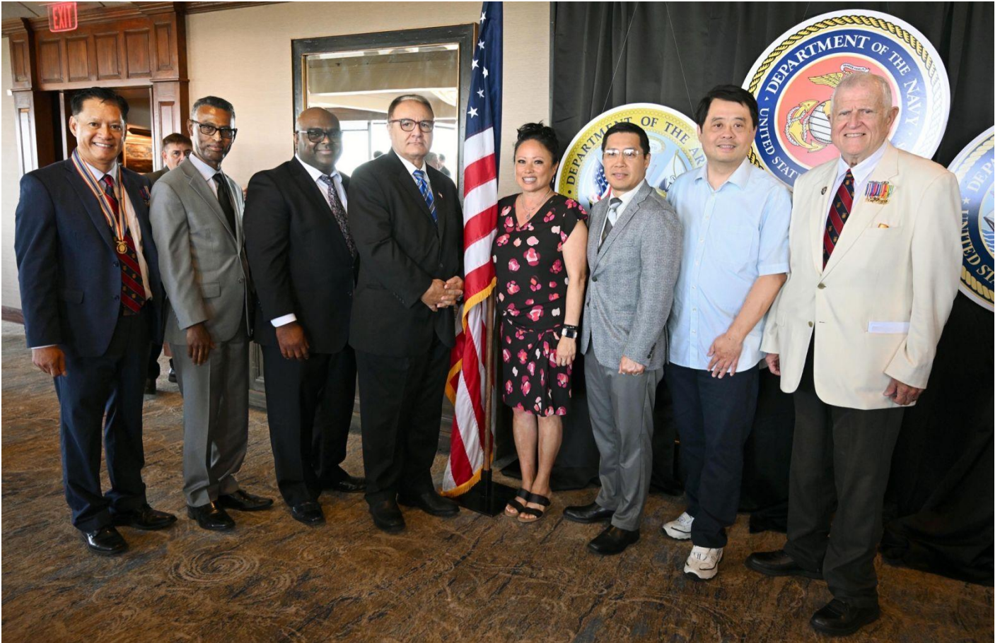
Celebration of Freedom Luncheon: First Generation Americans