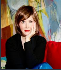
JANINE TURNER: The Continued Relevancy of the U.S. Constitution

Janine Turner, founder of the nonpartisan, educational 501(c)(3) Constituting America, is a three-time Golden Globe and Emmy nominated actress for Best Actress, known for the hit CBS television series Northern Exposure , the blockbuster movie, Cliffhanger , with Sylvester Stallone and Universal's Leave it to Beaver . She has also starred in many series: Lifetime's (with Whoopi Goldberg) Strong Medicine , and NBC's, Friday Night Lights , among others. Northern Exposure is currently in re-release, distributed in the United States via all Amazon platforms and worldwide in countries such as: Spain, Asia, Australia, Canada, Malaysia and the UK. Cliffhanger is poised for a sequel.