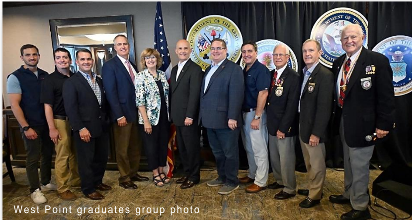
West Point graduates group photo