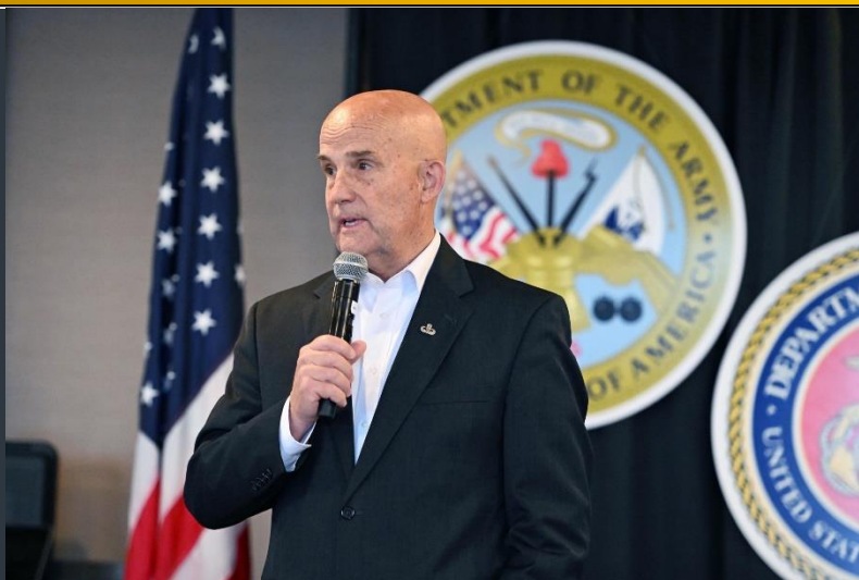
Congressman Keith Self informing participants about key legislative policies in Washington D.C. and ongoing issues impacting veterans, the current military standing and the security of Texas constituents overall.

In a room filled at a record capacity, Keith Self, former US Lieutenant Colonel, West Point graduate, now representative of Texas' 3rd Congressional District, gave a revealing synopsis of the current governance situation impacting our national security, veterans, and our youth's future.