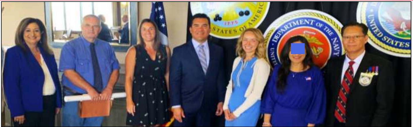
Our Luncheon was held on 5 July, the day after Independence Day. The theme was "Let Freedom Ring". We were honored and overwhelmed to hear from eight different speakers, from eight different nations, - all first generation Americans. Each spoke from the heart, expressing their profound gratitude to live in a land in which the rights of individuals are protected by the ideals contained in the Declaration of Independence and the US Constitution.